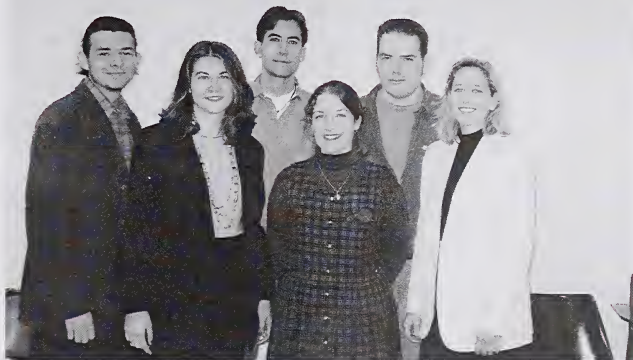
SUSK Eastern Conference Organising Committee from McMaster University: proud and happy

Editorial... Why to avoid the SUSK Congress like the plague