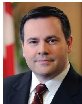
The Honourable Jason Kenney, PC, MP Minister of Citizenship, Immigration and Multiculturalism