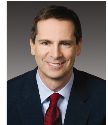
DALTON MCGUINTY PREMIER OF ONTARIO

Please accept my sincere best wishes for an enjoyable and informative congress.