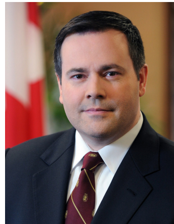
THE HONOURABLE JASON KENNEDY, PC, MP MINISTER OF CITIZENSHIP, IMMIGRATION & MULTICULTURALISM