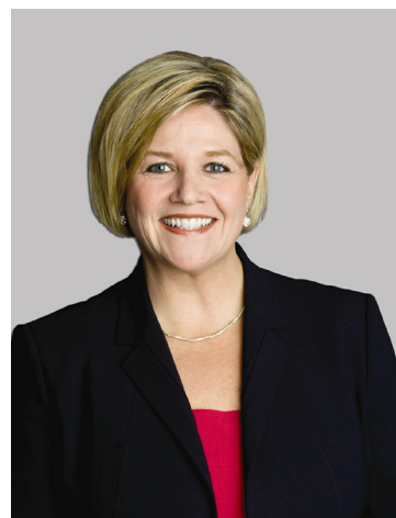
ANDREA HORWATH, MPP HAMILTON CENTRE