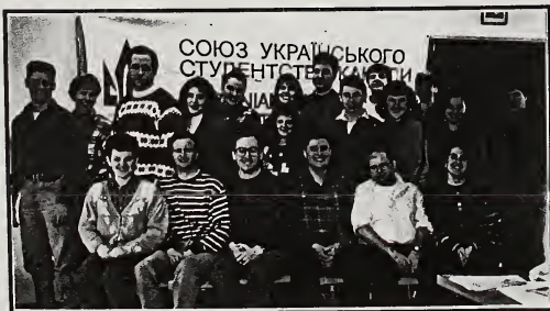
Delegates of CYCK Congress '93

It was a great weekend for everyone and if you missed it, too bad! (Don't worry, we'll do it again next year!)