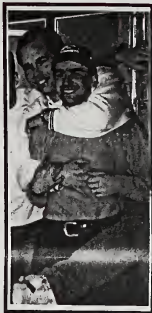
That's why U of T has two presidents!

Ukrainian Week '93 was Feb. 27 to March 5. The week started off with Super Zabava which reportedly had over 500 people in attendance. Other activities during the week included: artifact exhibits, dance performances, showing of the movie "Oxygen Starvation" (about life in the Soviet Army), panel discussion on Dilemmas of Independence in Ukraine, and a Taras Bulba night. The closing ceremonies featured Levko Lukianenko, Ambassador of the Ukrainian Embassy in Canada, giving the keynote address.