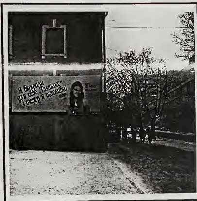
An ad found in Kiev on Lenin Street by the Fuji store. It loses something in the translation without explanation, so if you don't read Ukrainian, ask someone to explain!

The following are contributions from CYCK members that just don't seem to fit anywhere else! But, we love them, so if you have anything that is appropriate for this section, send it in!!