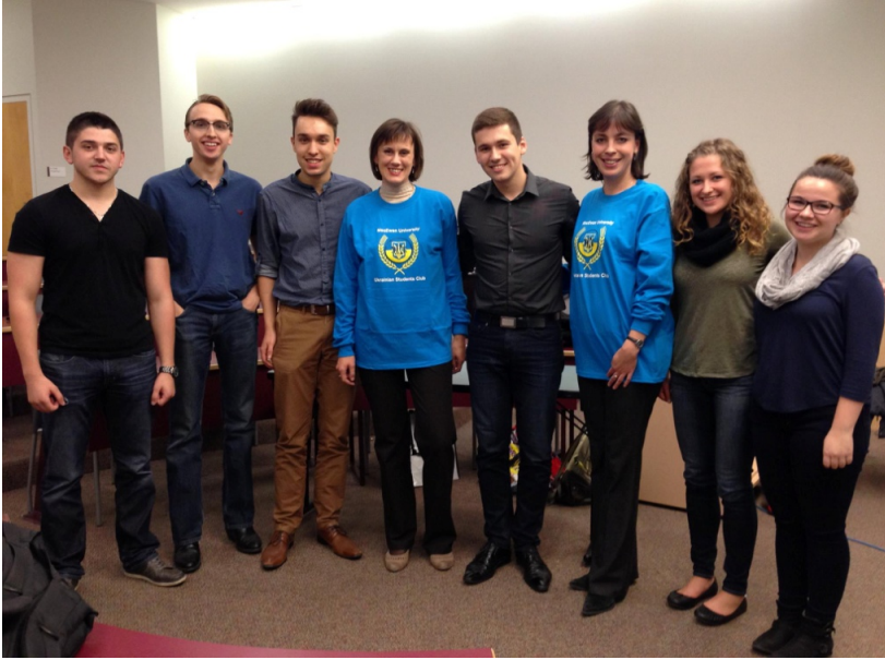
Professors from Ternopil

able to have a retired teacher instruct the course to students for a small fee. MacEwan currently does not offer Ukrainian language classes and this was our step towards promoting some interest in the language.