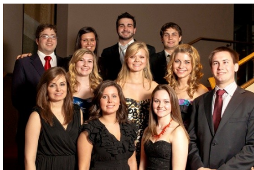
SUSK Executive 2011-2012

interested in running, you will be nominated for the position. The election process gives each candidate the opportunity to speak to his or her qualifications and then the Congress delegates will have the ability to question the nominees before the election takes place. If you think you are the right person for the job, check out the full job descriptions in the SUSK Constitution ( http://susk.ca/about/susk-constitution/ ) and join us in Hamilton for the National Congress.