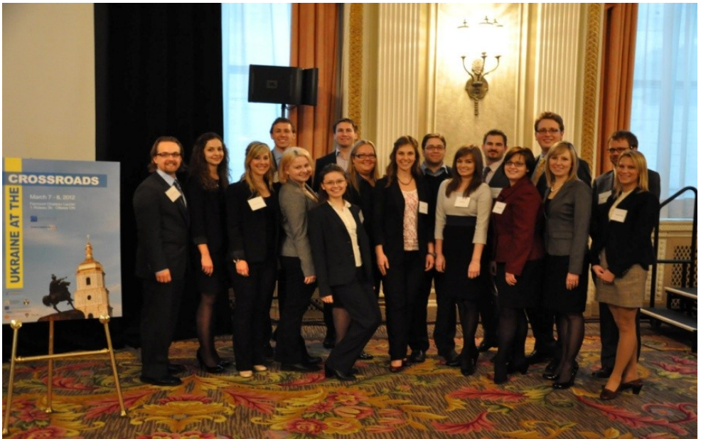
The youth delegation at the conference, sponsored by the BCU Foundation.

In my opinion, it would have been beneficial if more young adults- university students and young professionals- had attended the conference. Although it is imperative for the government of Canada to assist Ukraine in