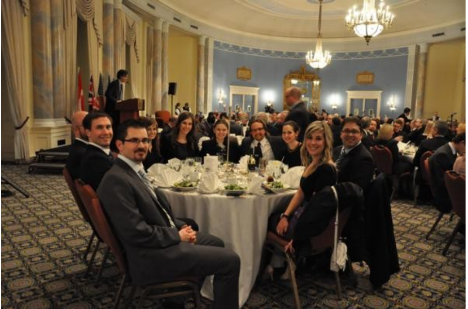
The youth delegation at the conference banquet. The event launched on March 7 with a banquet and a panel discussion moderated by Chrystia Freeland, Global Editor-at-Large at Reuters, and featuring current and former government officials.

In past visits to Ottawa and meetings with Members of Parliament, I have been witness to