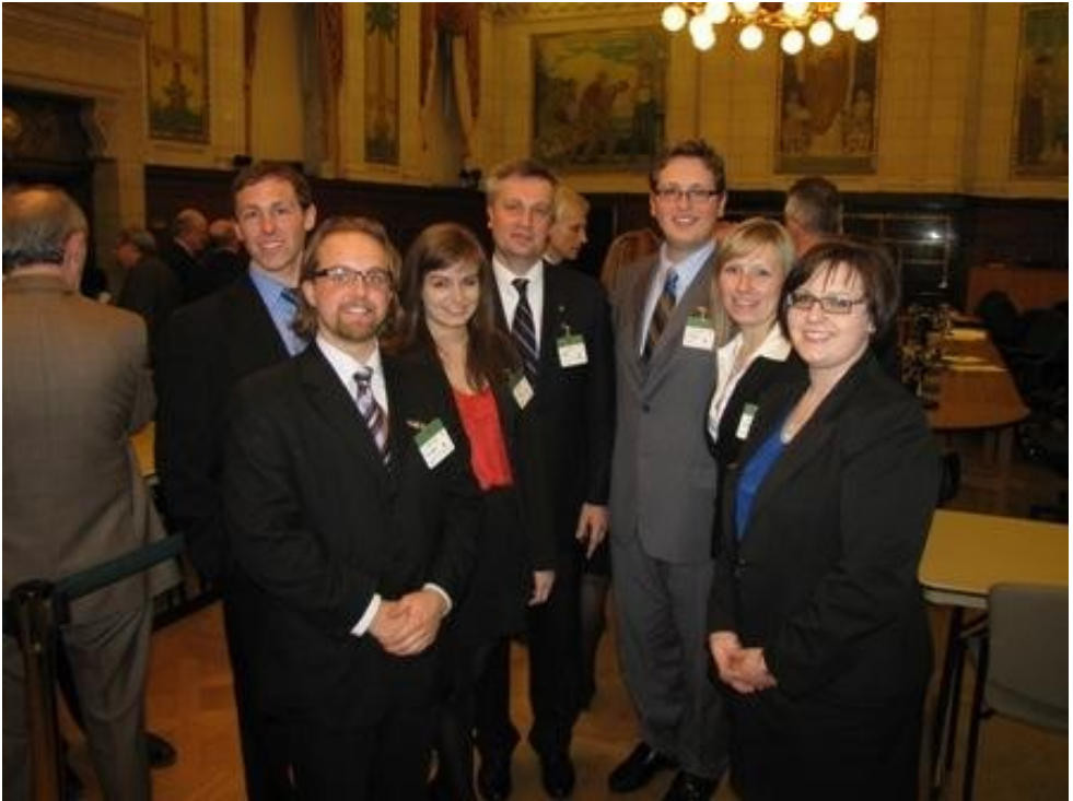
Some of the BCU Foundation Youth Leadership Delegation at the Hearings on Ukraine in Parliament

Canadian government's potential role in helping ensure fair and legitimate elections in Ukraine. As many of the speakers suggested, this is a long term enterprise, with a long term goal in mind. The most resoundingly logical way of accomplishing this, in my mind, is to engage the civil society in Ukraine, as many of the testifiers from Ukraine had underscored. The typical Ukrainian citizen is wary of challenging the established administration - a right some take for granted in Canada - for