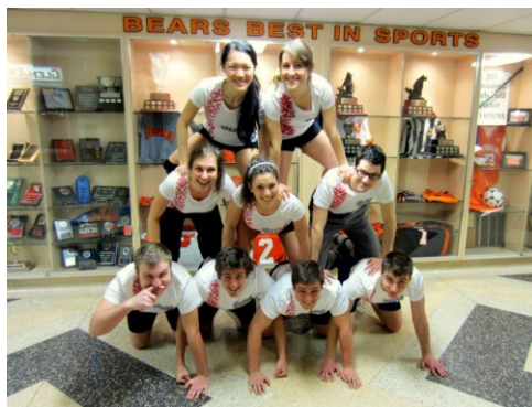
Team WUSA Waterloo Ukrainian Students' Association

The McMaster Ukrainian Students' Association kicked off its second semester by hosting the 10 th Annual Golden Horseshoe Volleyball Tournament & Zabava on February 4 th , 2012 in Hamilton, Ontario. This year the tournament had over 100 competitors in two categories of competition.