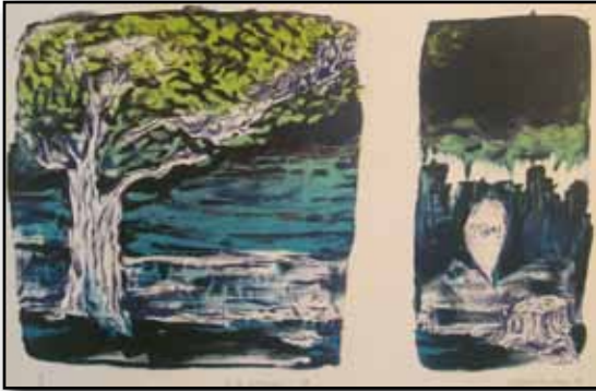
Left: To be continued...Part I, and To be continued...Part II