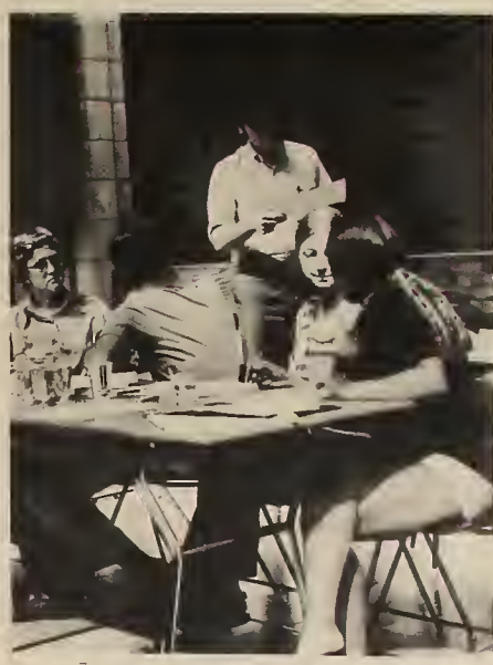
"Whadya mean 2 plus 2 equals 41"