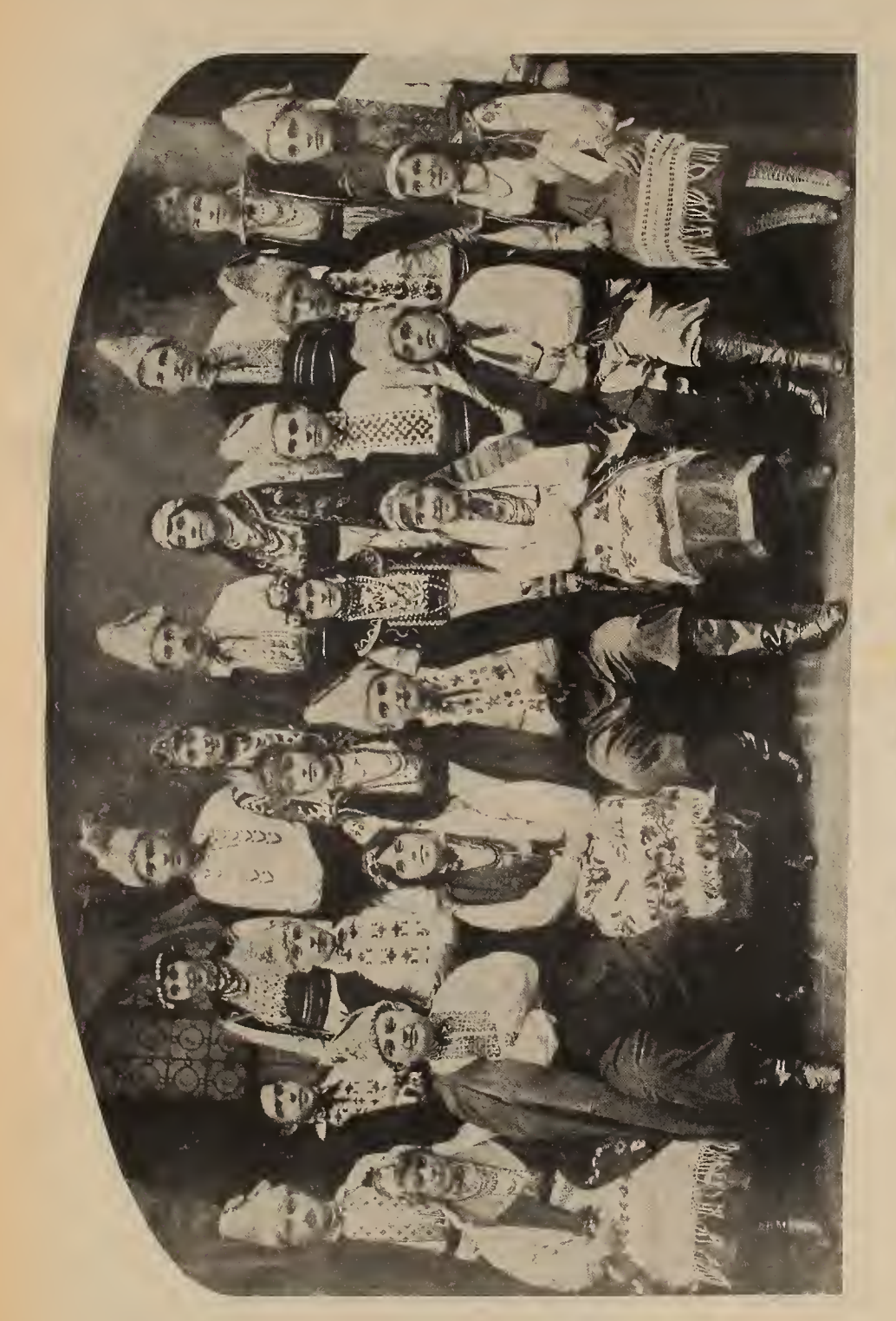
A GROUP OF UKRAINIANS, OR LITTLE RUSSIANS, IN NATIVE COSTUME

The Ukrainians work hard, fight hard, and play hard. They are blessed with an elastic temperament. One of their most striking characteristics is their love of the soil, to which they cling with remarkable tenacity. As these costumes show, they have a great fondness for beads, for fringes, embroidery, and gay colours.